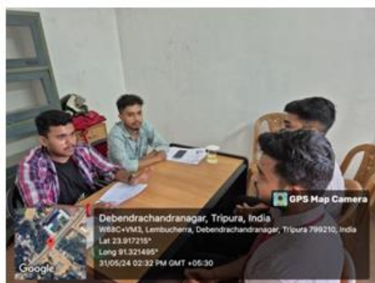
Picture taken during Placement Drive